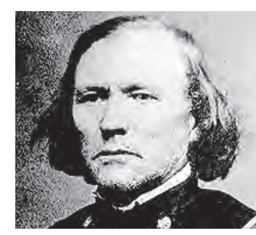
Christopher Houston "Kit" Carson

Like the Washo before them, explorers, trappers and the early gold-seeking emigrants of the 1800's would find the barren mountaintops and ridges as the easiest of passable routes through the mountains during the snow months. These high altitude routes were favored for travel because their exposure to the wind would scour away the deep, impassable snow pack.