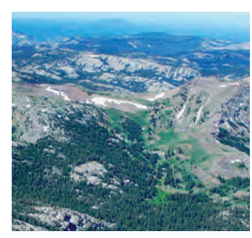
Covered Wagon Peak at Kirkwood

from the ropes and pulleys used to haul the heavy wagons up over the rugged terrain still remain. The trail continues around Emigrant Lake, located just south of Kirkwood's Iron Horse Chair #3, and then easterly along the south side of Caples Lake and up and over Carson Pass.