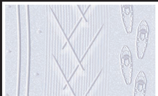
Classic Ski Track Skating Lane Snowshoe Lane

The trails have three distinct lanes; the classic track with grooves, a center lane for ski skaters and the far side for snowshoes.